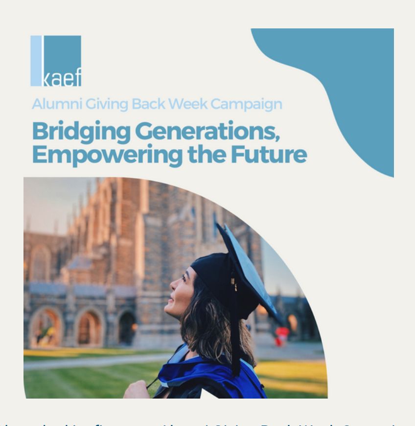
July 3rd, 2023 - KAEF launched its first-ever Alumni Giving Back Week Campaign, aiming to rally the community for a collective cause of raising $10,000.

The goal was for half of this amount to come from KAEF alumni and supporters, and the rest being matched by FINCA Kosova, the generous matching donor of the campaign. The funds raised through this campaign were directly channeled towards scholarships and other essential educational initiatives at KAEF.